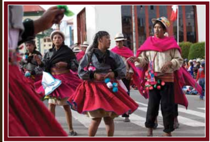
100's of villagers send dancers to this reverent celebration