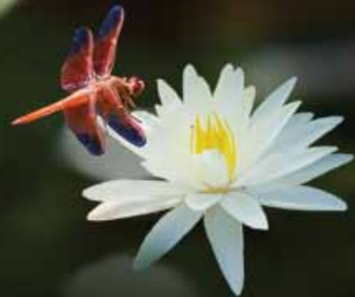
Lotus, peace and enlightenment and Dragonfly, messenger to the spirit world

— Douglas Brinkley, author CNN interview with Anderson Cooper 2010