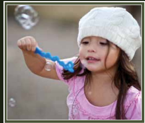
Child, Dragonfly Village, Amity Foundation, Tucson, Arizona, USA

— Malvina Reynolds August 1900-March 1978