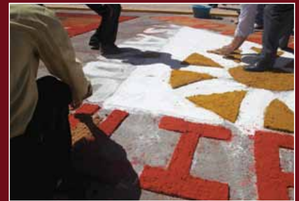
Laying flower petal mosaics in preparation of celebration