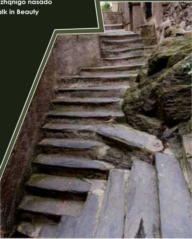
Steps, Vernazza, Cinque Terre, Italy