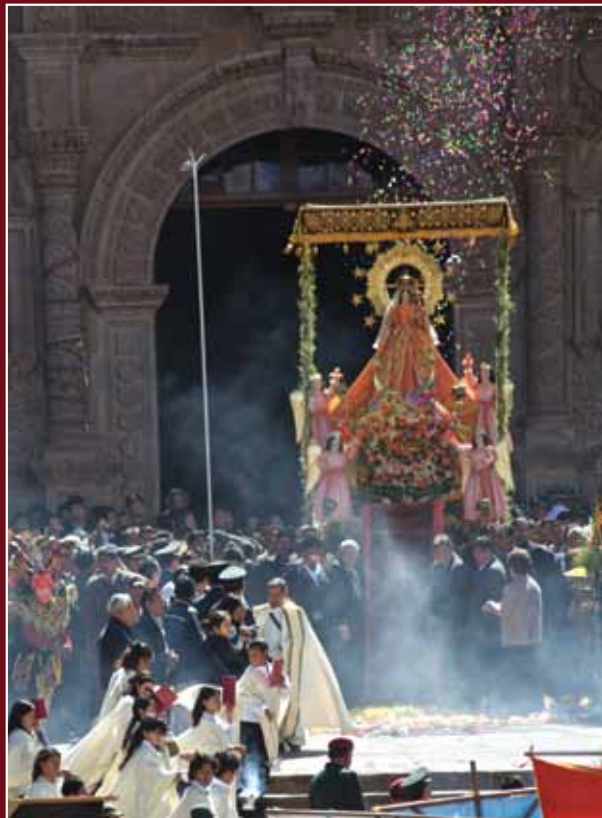
Procession of virgin of candelaria showered in rose petals

The people of the Altiplano surrounding, Lake Titicaca, gather yearly, and pave the streets with flower petal mosaics, they dance and carry the Virgin of Candelaria through the streets. It is believed that this festival is the melding of the Catholic tradition with that of the ancient offerings to Pachamama, or "Mother World", the benevolent goddess of the Inca Empire.