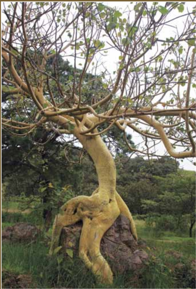
Goddess Tree, Rio Caliente La Primavera, Jalisco, Mexico