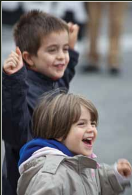
Cheering for dad at triathlon finish line Lerici, Italy, 2010