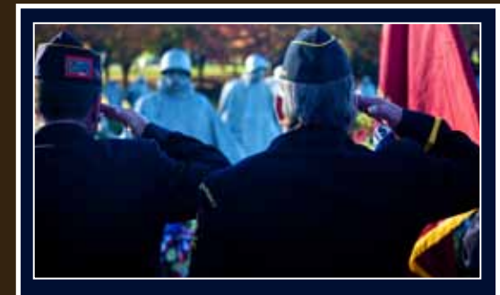
Taps, Korean War Memorial, Washington, DC, USA

— Dwight D. Eisenhower Farewell Address, January 1961