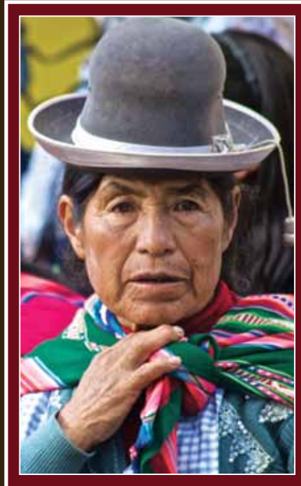
Aymara, Lake Titicaca, Puno, Peru

— Alice Walker, 2010 excerpt from Hard Times Require Furious Dancing